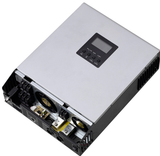
HOMIV Inside Overlook